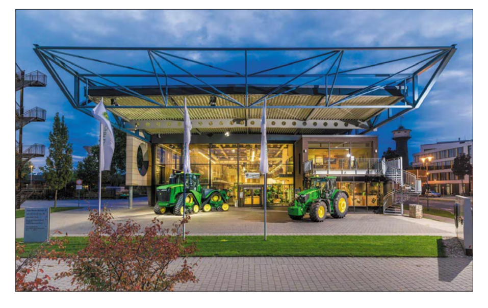
The John Deere Forum as conference venue visually connects the city and the countryside.

(urban) environment, "from urban microclimates and heat islands to long-term, large-scale measures".